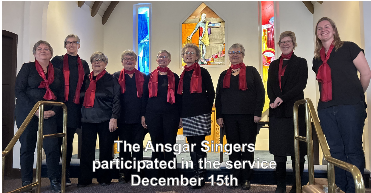
The Ansgar Singers participated in the service December 15th